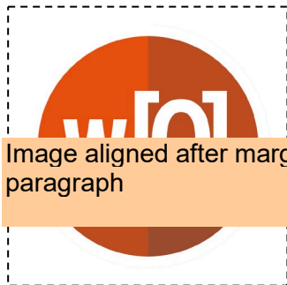
Image aligned after margin at start of paragraph